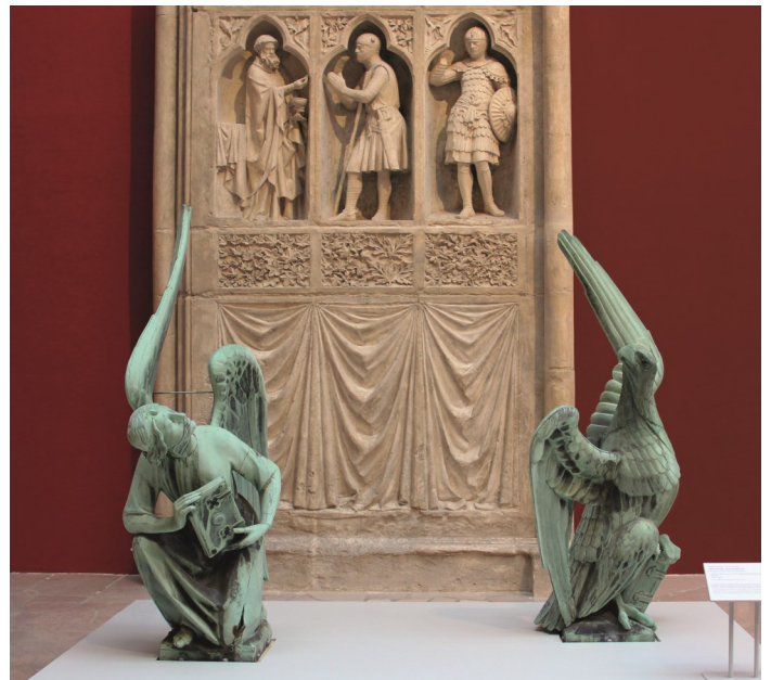
(Left) Auguste Bellu, model of the spire of Notre-Dame, wood, 1859, D.MAP/CRMH24a  Cit  de l'architecture et du patrimoine

In addition to the sixteen sculptures forming the spire, La Cit  is also home to the cockerel which sat abreast the Cathedral. This was found the day after the blaze and will not be restored, instead bearing witness to the tragic fire. This presentation amongst our collections of a public institution is fundamental for dissemination of knowledge as these sculptures are, at present, a cherished link, often brimming in emotion, with the closed Cathedral.